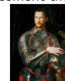
Agnolo Bronzino, Cosimo I de Medici in Armour, c. 1545, Detroit Institute of Arts.

Whether speaking about Lorenzo de Medici ( Il Magnifico ), Cosimo I de Medici, Giuliano de Medici (Pope Clement VII) or even Catherine de Medici (Queen of France and Mother of three kings of France), there is no shortage of key individuals throughout the entire Medici dynasty who have contributed a great deal to the advancement of their fortunes whether financially, politically or in elevating their social status. From their relatively modest beginnings as wool merchants to successful bankers and their rise to nobility as Dukes of Florence, their political intrigues and art patronage have played an important role in the making of the Medici. This lecture traces the journey of some key members of the Medici family to illustrate the political strategies that they employed and how they ultimately used art to confirm their rule in Florence and cement their noble status.