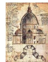
Dome of the Santa Maria del Fiore - drawing by Filippo Brunelleschi

Benozzo Gozzoli, The Procession of the Magi , on the Eastern Wall of the Capella dei Magi, Palazzo Medici-Ricardi, Florence, 1456-62.